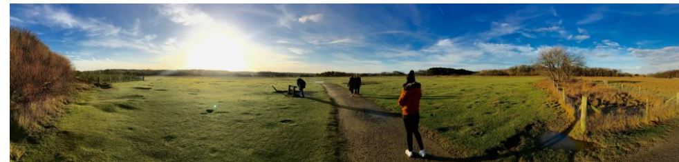
Chaplaincy team had a planning away-day in Freshfield (12 th of January).

Sunday 24 th January 2016 | 0161 273 1456 | general.muscc@gmail.com