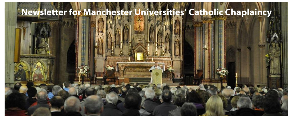
Newsletter for Manchester Universities' Catholic Chaplaincy