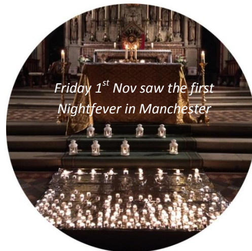
Friday 1 st Nov saw the first Nightfever in Manchester

Don't forget to register at muscc.org to be updated of future events – there is loads coming up so don't miss out!